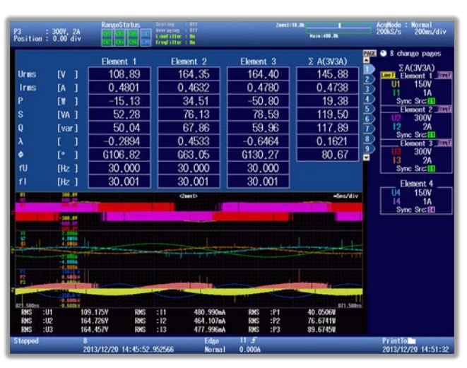
Measures inverter waveform at 100 MS/s and displays voltage, current, power results.