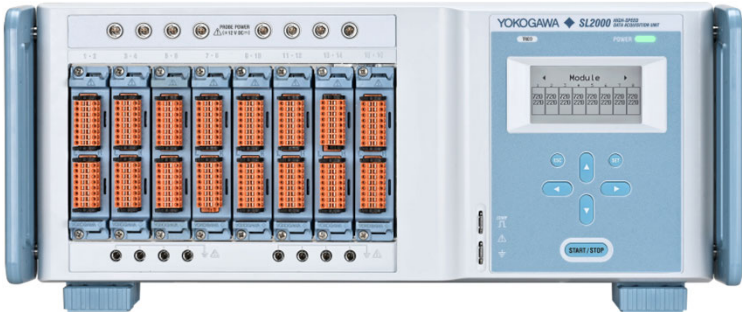
SL2000 + 720220×8